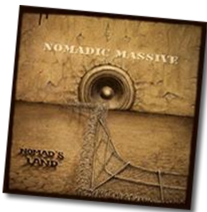
Nomadic Massive Nomad's Land EP, 2006 (Nomadic Massive Productions/PTR Records)

"This is Hip Hop at its finest - a giddy, funky pass-the-mic throwdown, with smiles all around."